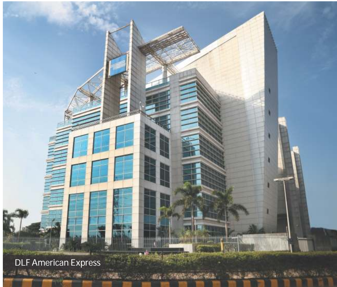
DLF American Express